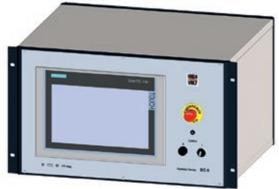
Fig. 1 Operator device HiCO Basic