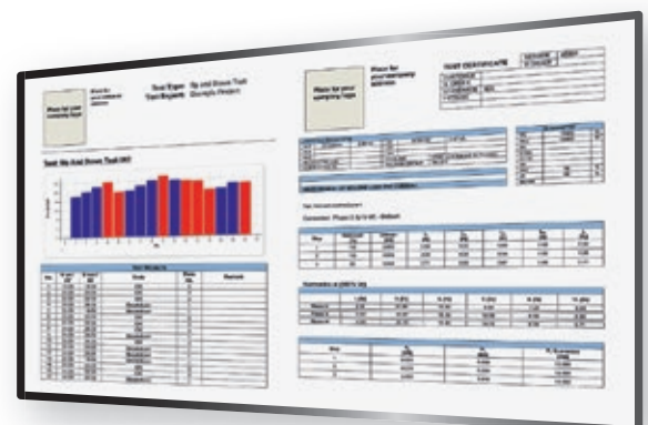
Fig. 3 How the central database works