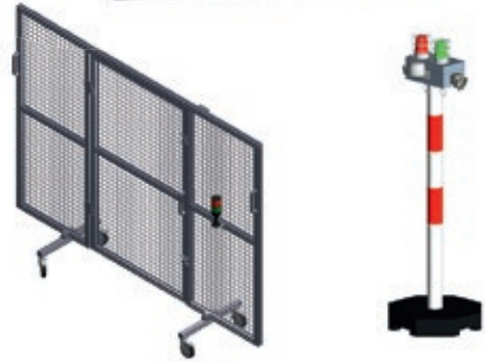
Fig. 5 Safety measures: test bay visualization (top), safety guard (left), safety column (right)