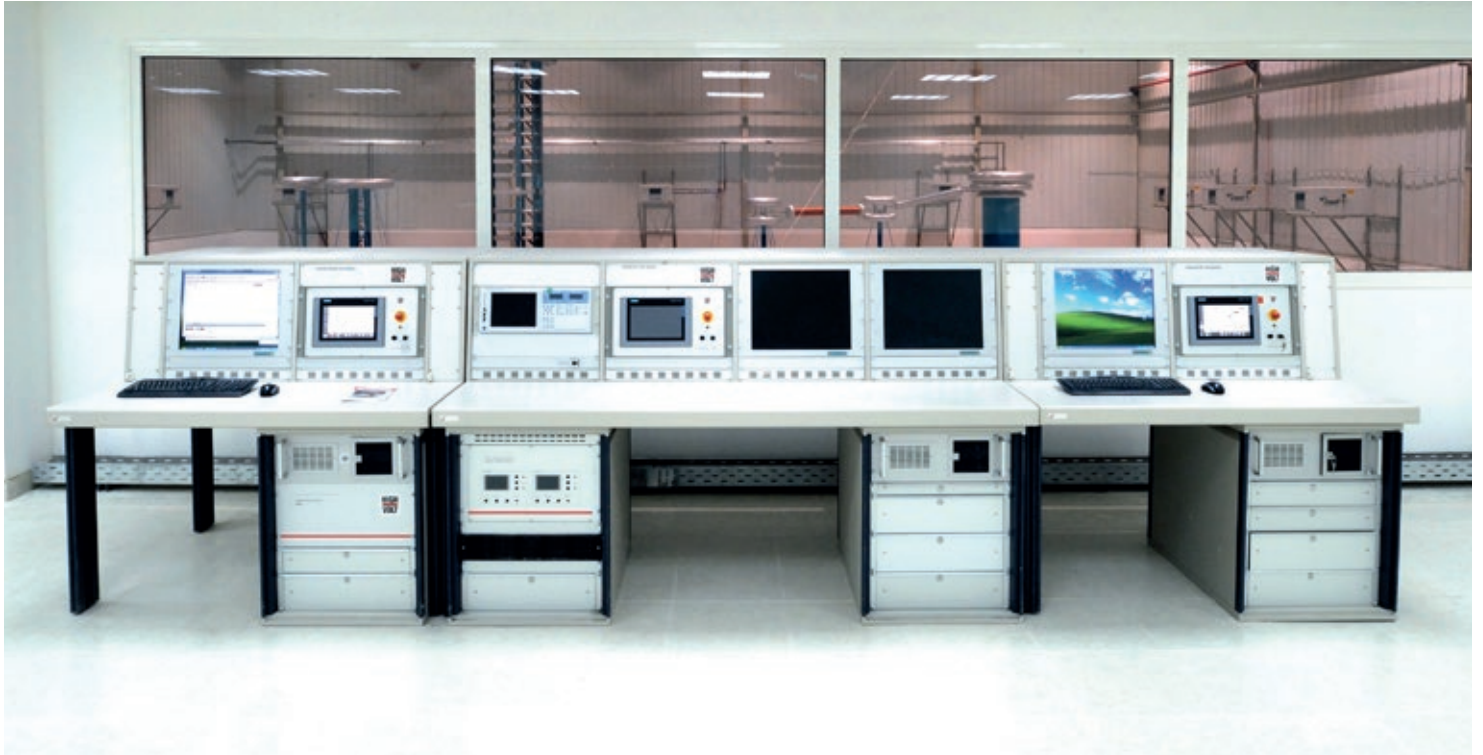
Fig. 7 Control room with operator desks (OD) of a transformer test bay with several high voltage test systems