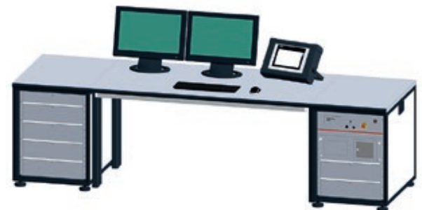
Fig. 2 Operator board containing the advanced control