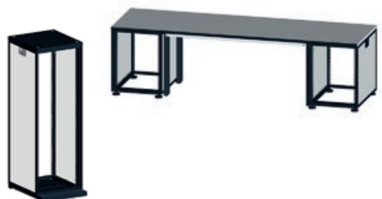
Fig. 6 Housing types: operator rack (left) and operator board (right)