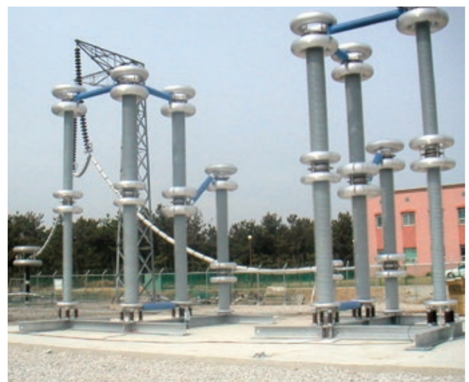
Fig. 4 Double-pole 600 kV outdoor HVDC test system type FGP 200/600

Note: The HVDC power supplies do not need to fulfill voltage shape requirements (e.g., ripple) based on the standard IEC 60060-1.