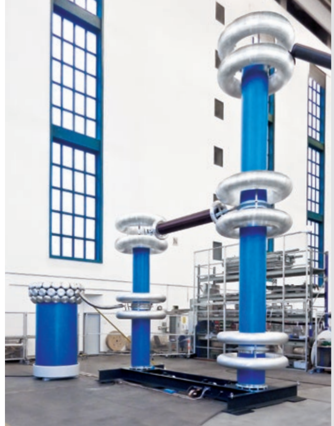
Fig. 2 HVDC power supply type GE 200/900