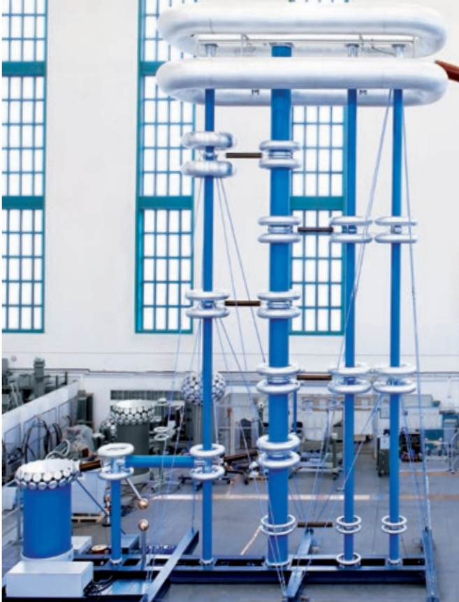
Fig. 1 HVDC test system type GP 50/2000