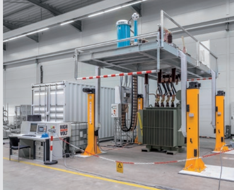
Fig. 2 Example showing the practical implementation of a customer-specific automatic switching system with height adjustment