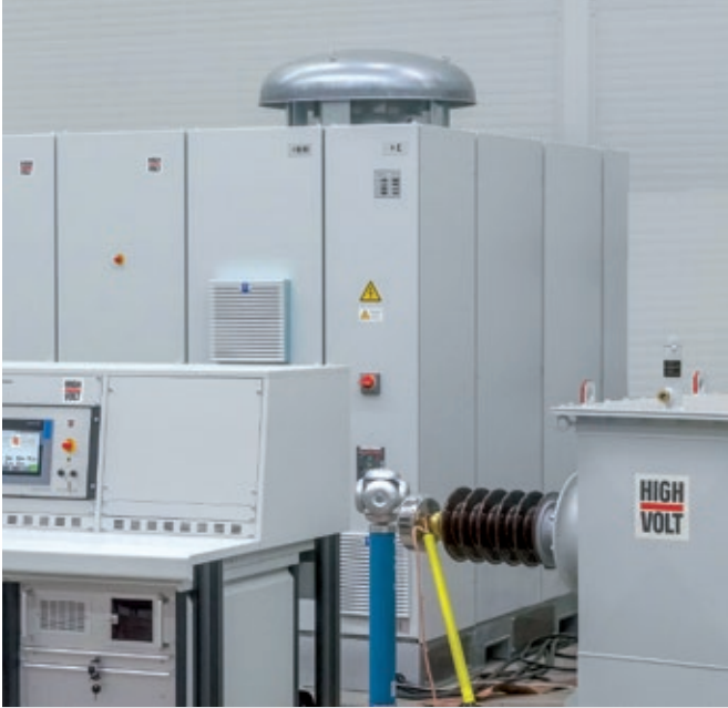
Fig. 1 Fully automated control system and frequency converter